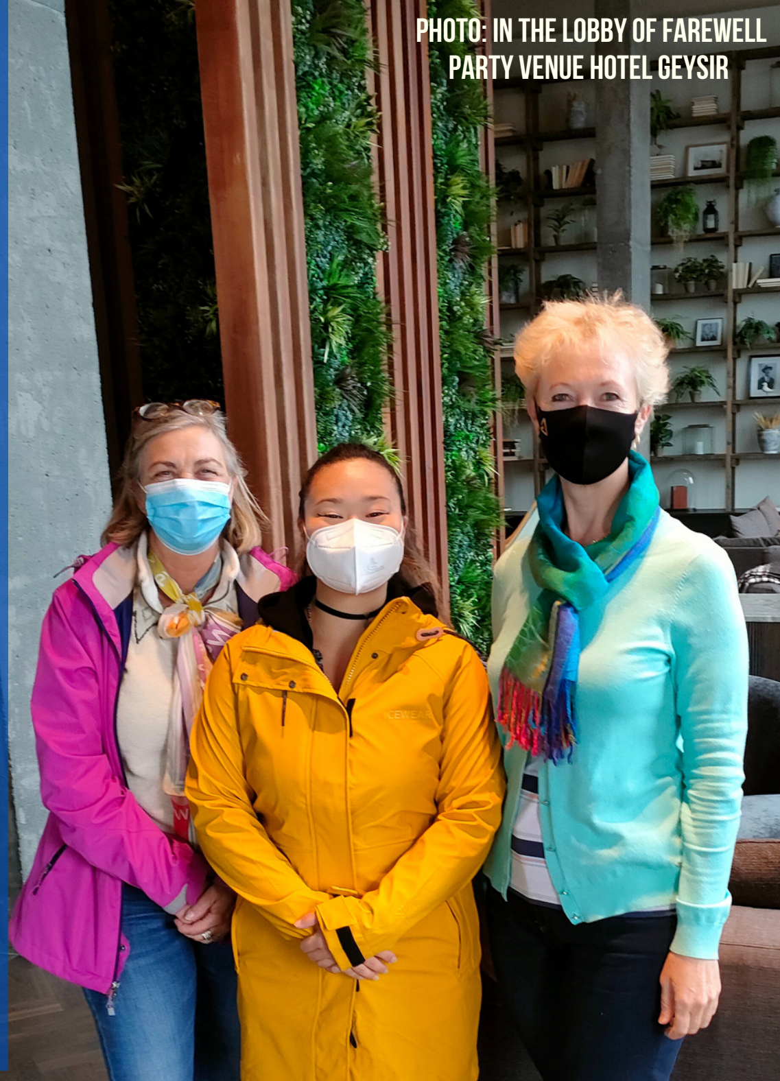
PHOTO: IN THE LOBBY OF FAREWELL PARTY VENUE HOTEL GEYSIR