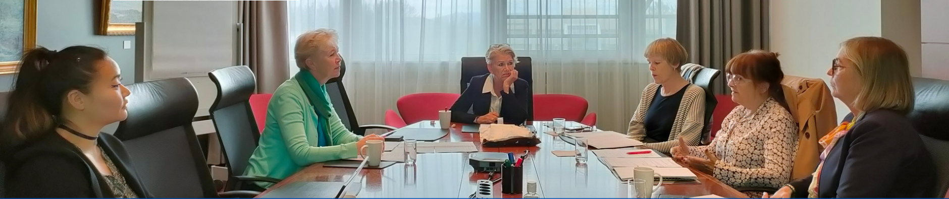
PHOTO: IN THE BOARD ROOM OF HILTON NORDICA REYKJAVIK